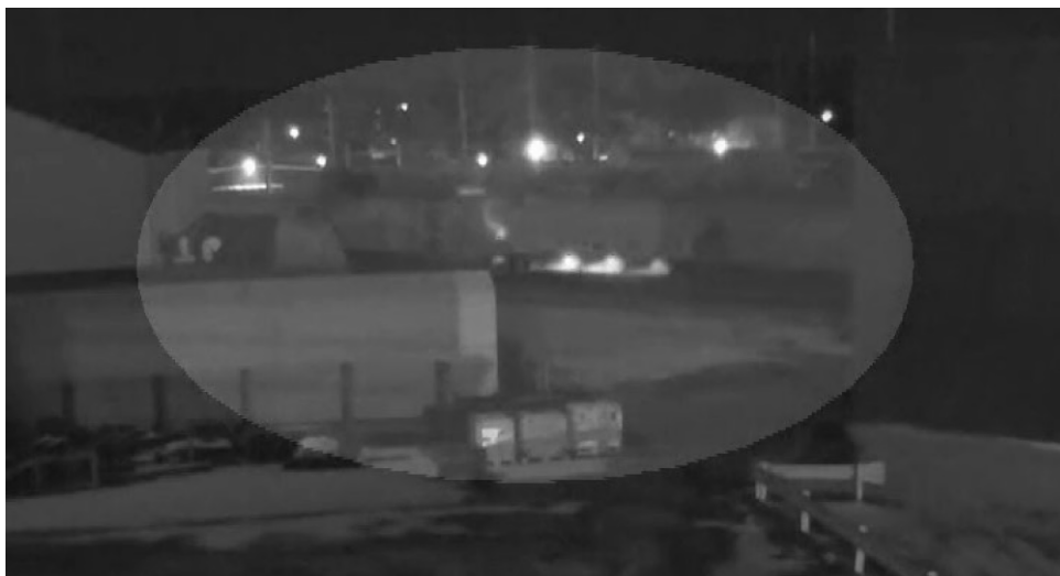
Still frame from surveillance video taken in Salem, Ohio - 20 miles away from the train derailment site.

162. On the Fort Wayne Line, NSC and NSRC had equipped their rail network with hotbox detectors to assess the temperature conditions of railcar wheel bearings while en route.